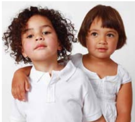
Growing our future - New Zealand's largest longitudinal study is featured in Auckland Now