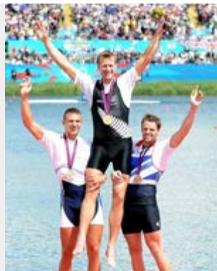
Mahe Drysdale is lifted on the shoulders of the silver and bronze medalists