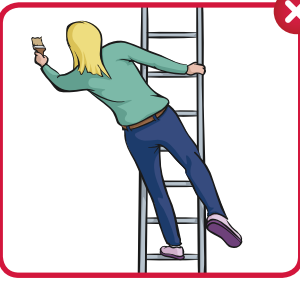
Never over-reach sideways.