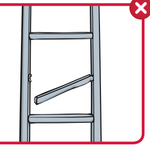
Never use a ladder with missing, broken or loose parts.