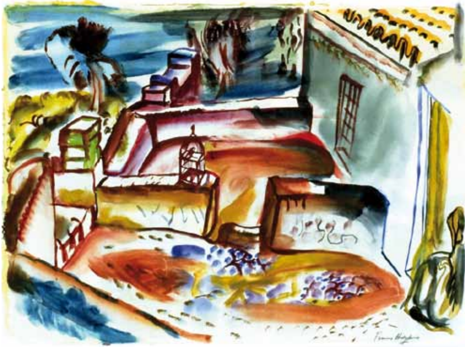
Frances Hodgkins (1869-1947) Courtyard in Ibiza 1932-33 watercolour, 395 x 540mm

A childhood in Dunedin gave painter Frances Hodgkins a life-long aversion to cold weather. The south of France was her usual destination as soon as dreary English winters began to bite, but in the middle of the Depression she ventured instead to Baleares, the third largest of the Balearic Islands off the coast of the Spanish town of Valencia in the West Mediterranean. Better known now for the dance parties and rave culture that made it iconic in the late 1990s, the Balearic capital of Ibiza was fascinating to Hodgkins for its Roman, Phoenician and Carthaginian remains, and its famous whitewashed architecture.