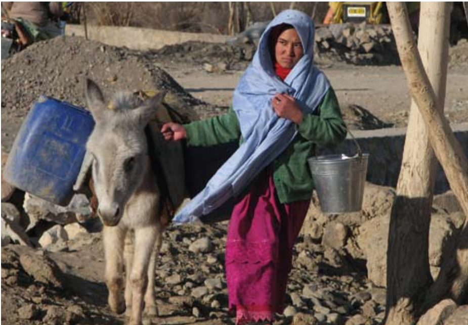
Afghan girl with donkey collecting water.