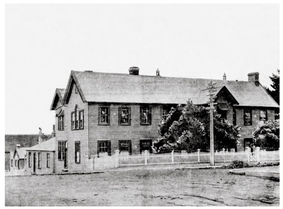
The University College occupied a two-story building known as "Old Parliament House", or to students as 'The Shedifice', from 1890.

How much was the University's caretaker paid in 1895? Where was the only place that smoking was allowed according to the 1933 regulations for the conduct of students?