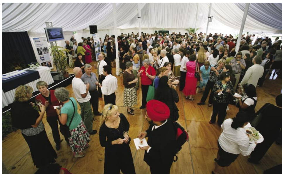
Some of the many staff who attended the Vice-Chancellor's cocktail party.

"Many of them, including our University, are now among the most prestigious universities in the