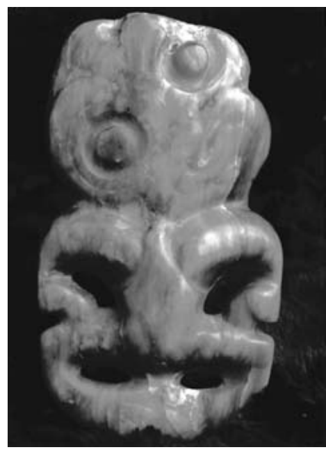
Little River Hei Tiki (female, Ngai Tahu) 2003, C-type print, 1960 x 1600mm.

Pregnant with mystery, this huge image of a hei tiki glowing against a dark background is magnetically attractive. It is one of a range of