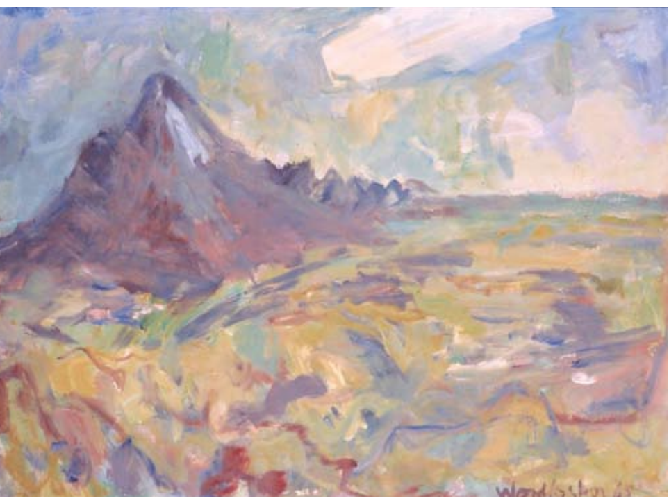
Taranaki Landscape 1965, 609 x 808mm, Oil on hardboard.

Woollaston's parents were fundamentalist Christian sharemilking dairy farmers, and he was born in rural Huinga near Toko in Taranaki. In his book Sage Tea he reveals the repressiveness of his upbringing – the beverage of the title was