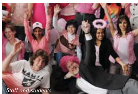
Staff and students.

Male students begged and borrowed their girlfriends' pink t-shirts to show support for the cause. The success of the day has earned the event a firm place in the faculty calendar for 2009.