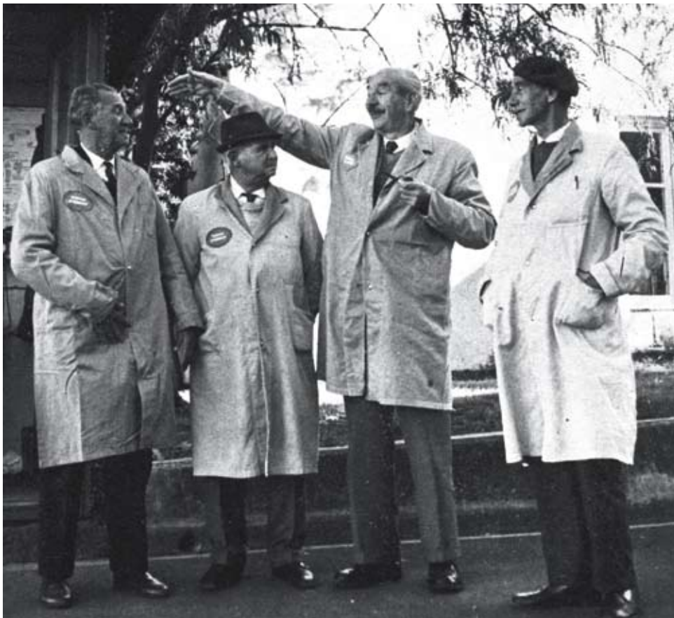
Four of the University's staff of gatemen in 1971.

Extracts from "Campus Parking", University of Auckland News 5, July, 1971, p.34.