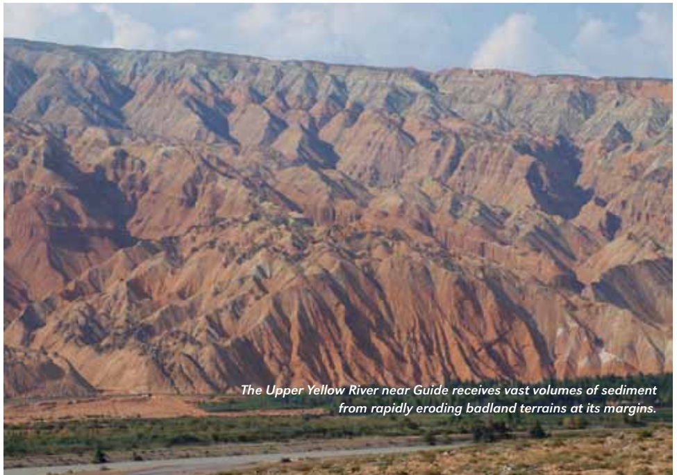
The Upper Yellow River near Guide receives vast volumes of sediment from rapidly eroding badland terrains at its margins.

established the second largest natural reserve in the world in the Sanjiangyuan region. This reserve extends over an area in excess of 150,000 square kilometres (about the same size as England and Wales combined).