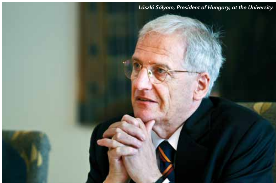
László Sólyom, President of Hungary, at the University.