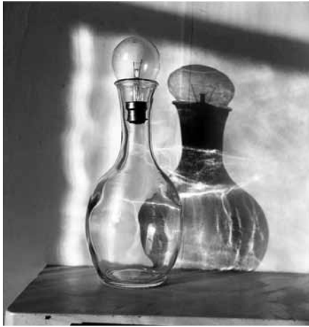
Bill Culbert (b.1935), Decanter, London, 1985 . Black-and-white photograph, 190x190mm The University of Auckland Art Collection

The unlikely pairing of wine and filament light bulbs has long been a recurring motif in the highly sociable work of Bill Culbert, as has the fluorescent tube, all of which act as metaphor and evidence of the ways we think about light, energy and materials.