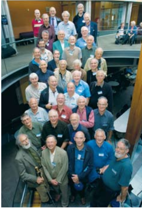
More than 40 engineering graduates from the Ardmore class of 1958 travelled from all over the world to reconnect with old classmates at special reunion held in April.

The Ardmore class of 1958 have reunited more than 50 years after they studied engineering together.