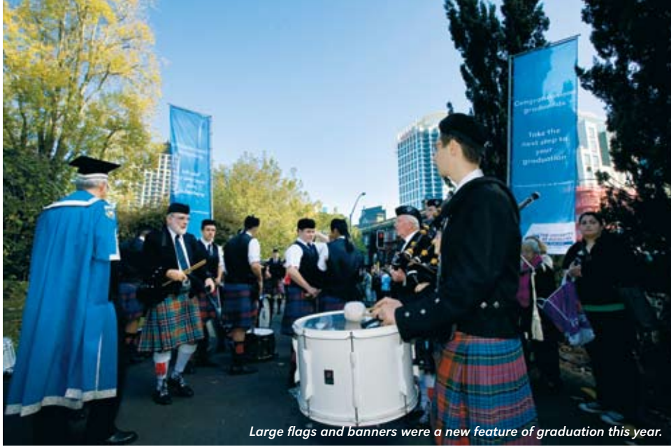
Large flags and banners were a new feature of graduation this year.

Thousands of graduates and their families brought colour, pageantry and celebration to central Auckland last week.