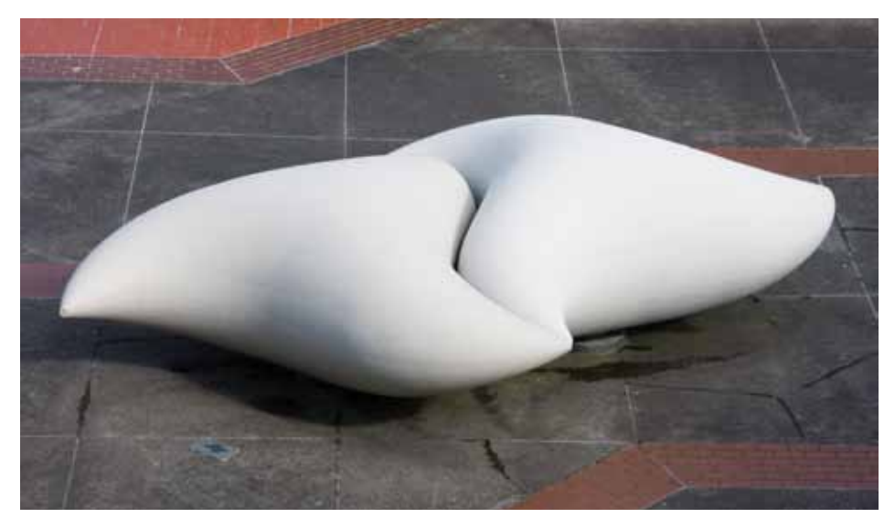
Chiara Corbelletto (b.1956), Twins, 2003. The University of Auckland Art Collection

Chiara Corbelletto's work sits somewhere between the worlds of art, design, architecture and mathematics, which is not surprising considering she completed degrees in Fine Arts then Architecture in Italy before emigrating to New Zealand in 1981. She was born in the Northern Italian city of Biella, and the ornately decorated surfaces of the classical architecture she grew up with have influenced her rhythmic assemblages of abstract patterns.