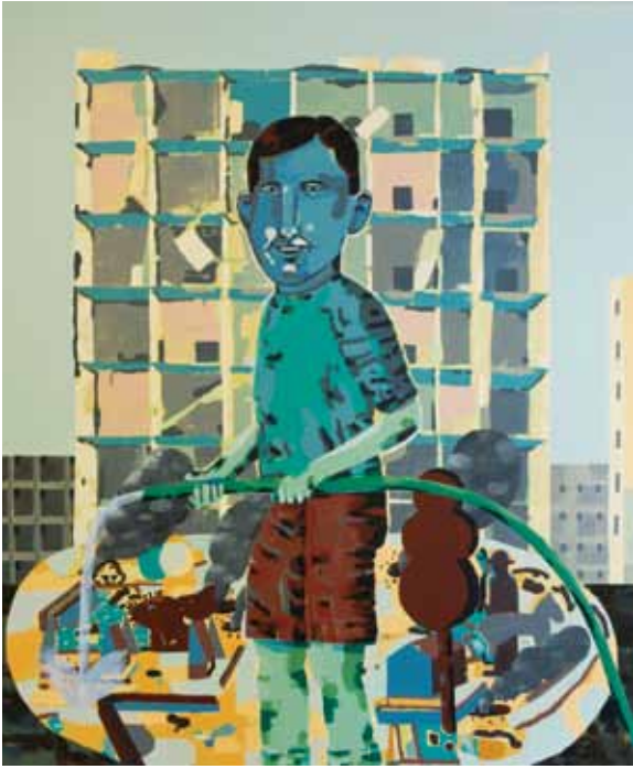
Denys Watkins, Encounter of the Third Kind 2008, acrylic on linen, 1825 x 1525mm, The University of Auckland Art Collection

Recalling Stephen Spielberg's 1977 science fiction blockbuster Close Encounters of the Third Kind with its title, this large acrylic painting in ice-cream colours seems spookily familiar