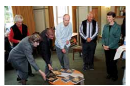
First look at the book for some of the authors.

The launch of a new book on 30 April in the Vice-Chancellor's Suite at Old Government House marked a significant milestone for the School of Theology as well as the culmination of a pioneering task.