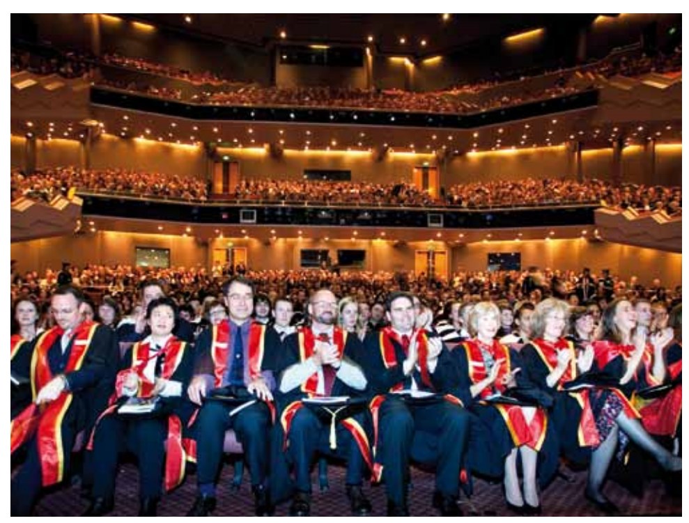
Autumn Graduation 2010: one of 11 ceremonies.

Years of hard academic toil reached a celebratory climax when thousands of University of Auckland students graduated during the first week of May.