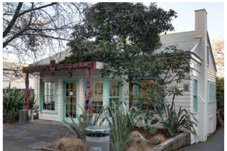
A recent photo of 18 Wynyard Street