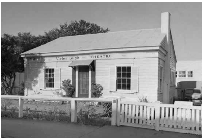
18 Wynyard Street, 1965.

*A classic newspaper typo; the play's correct name was "The Overseas Expert"