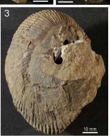
1. Xenocephalites grantmackiei, male; 2. Araucanites spellmani, male; 3. Araucanites spellmani, female. Figure by Louise Cotterall, School of Environment.

Before I became a collections manager, I extracted a number of Middle Jurassic (176-164 million years old) ammonite fossils from the Port Waikato, Kawhia and Awakino areas.