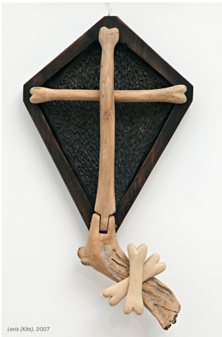
Levis (Kite), 2007

Tanalised pine is not a traditional material for kite making as it tends to succumb to gravity rather than defy it. Yet Warren Viscoe's skilful handling of it renders his wooden kite believably lightweight, subject to gust or breeze. The spine and cross-spar bend and curve like a nylon tube would, and the roughened body of the kite imitates the ripple effect of wind on fabric. Though pine, these elements of its structure are been carved to look like bone, furnishing a macabre mien at odds with the idea of a playful, uplifting, childhood toy.