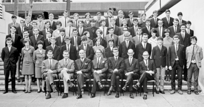
The first intake of students at the University of Auckland Medical School in 1968.

The University's Faculty of Medical and Health Sciences (FMHS) is celebrating its milestone 50th anniversary with a series of events throughout 2018.