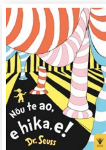
The first four te reo Māori books from the Kotahi Rau Pukapuka project are out on 5 November.