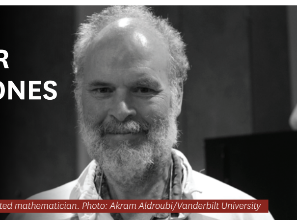
Sir Vaughan Jones was our most talented mathematician.

New Zealand’s most celebrated mathematician, Sir Vaughan Frederick Randal Jones, the only New Zealander to be awarded the maths equivalent of the Nobel Prize, the Fields Medal, died suddenly in September aged 67.