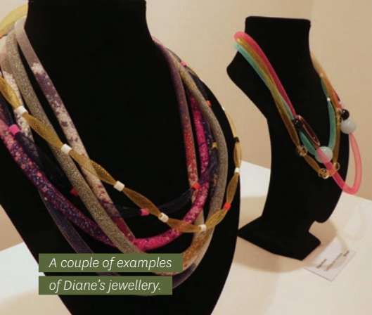
A couple of examples of Diane's jewellery.

"In a leadership position you often have to implement things you don't agree with, but it's the job, and it's important to remember that the discontent directed at you is most often not personal but a consequence of your position."