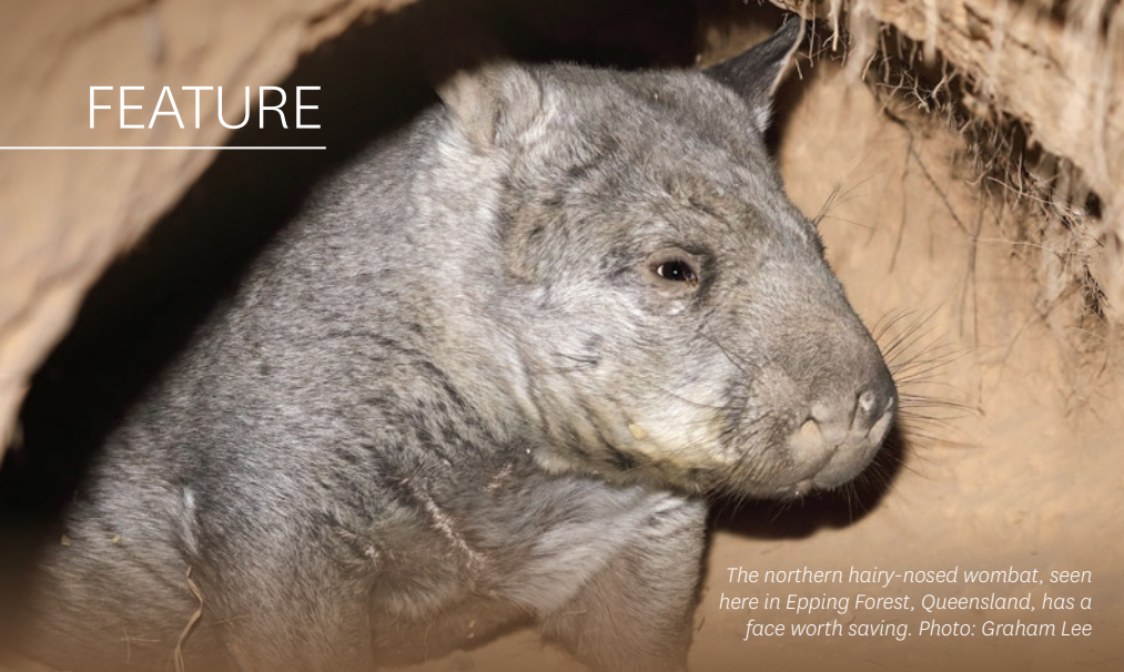
The northern hairy-nosed wombat, seen here in Epping Forest, Queensland, has a face worth saving.