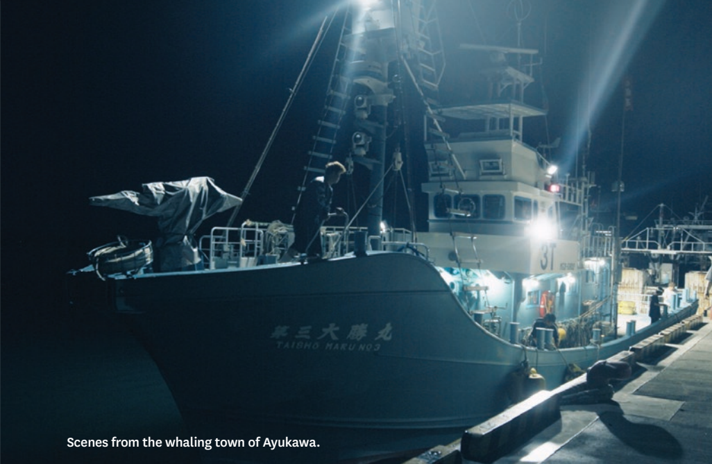
Scenes from the whaling town of Ayukawa.