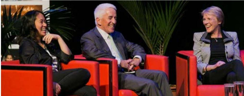
Some of the 2014 Distinguished Alumni at last year's Auckland Live!