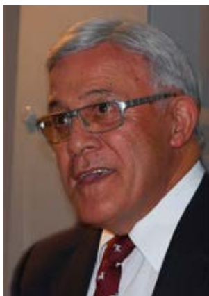
2015 Distinguished Alumnus