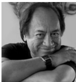
Witi Ihimaera, one of the competition judges