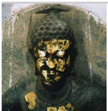
Jon Carapiet - Untitled (2008)

CALLING - an exhibition of paintings and photography by Elam graduates Grant Whibley, Shruti Yatri and Jon Carapiet takes place at the New Zealand Steel Gallery Pukekohe 17 September - 19 October.