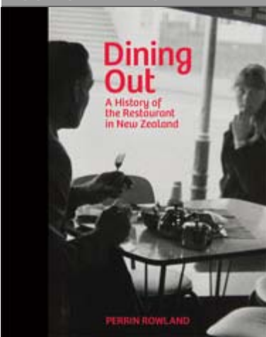
Dining Out: A History of the Restaurant in New Zealand