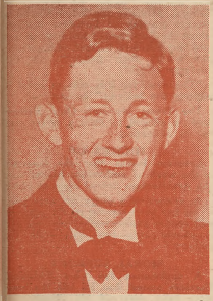
RED RIDING HOOD

• It is riddled with suggestive situations. The story has as its theme a presumably unmarried woman alone in the woods with a "wolf." To prolong the sordid incident she packs a lunch to take along, and thus makes matters There is too a scene in which a male exchanges places in a bed with