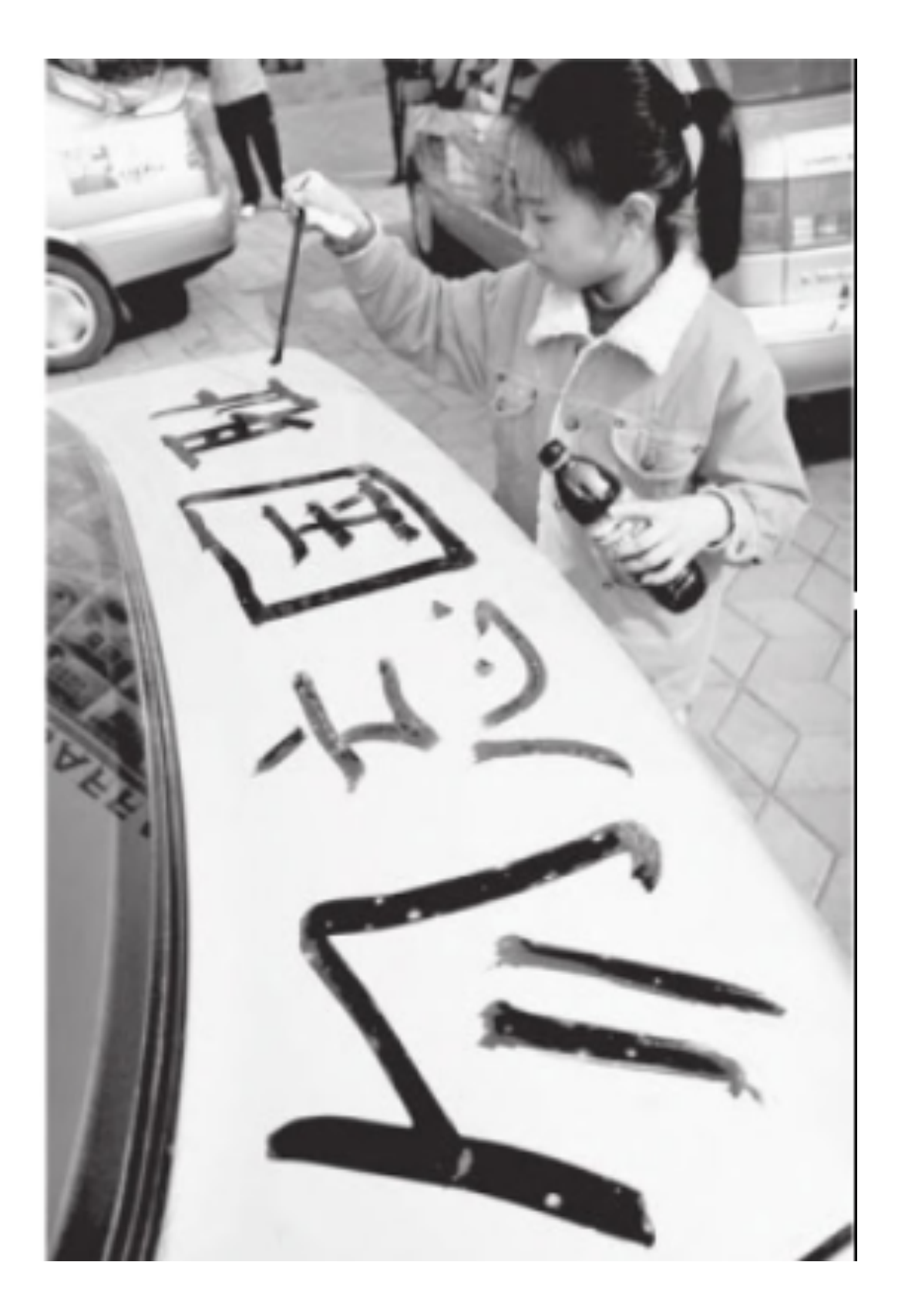
Image Two: Nine-year-old School Girl painting the phrase "Never Forget National Humiliation" during an anti-Japanese protest (2005). <sup>27</sup>