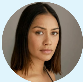
LUCIANE BUCHANAN Actor, Producer, and Screenwriter

"I'm very lucky to be where I am now career-wise, but it is still challenging. In this line of work there is always something to learn, and I want to be pushed, in whatever is next."