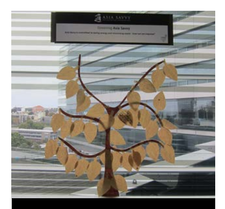
Asia Savvy Sustainability Tree with suggestions from participants on how we can minimise waste for future events.

During the event, students carried out a transport survey while we collected data relating to our plant and buildings for analysis. The students were invited to firstly be 'eco-savvy' about their own environmental impact during the day. They provided suggestions on how we could further improve our environmental impact as seen on our Asia Savvy Tree.