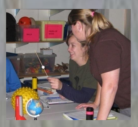
A heliocentric or a geocentric solar system?