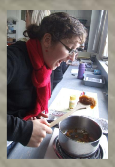
Cooking up a model of an igneous rock......