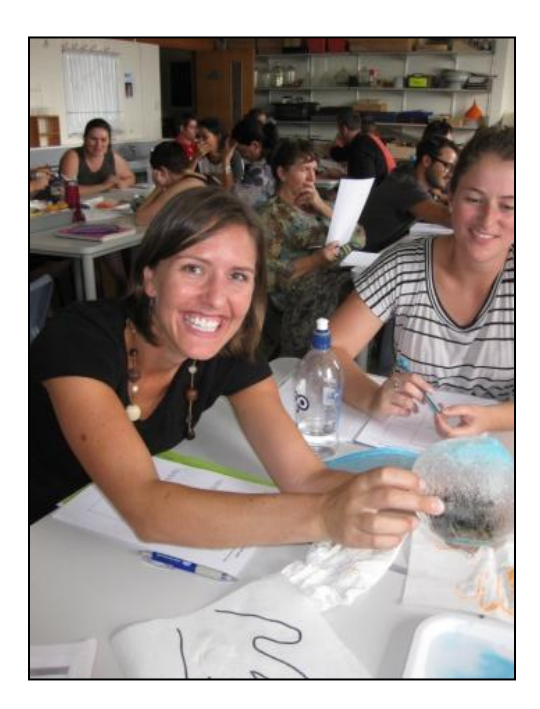
This look of sheer delight was not at the camera – but rather in seeing the 'sparks' in a melting ice balloon.

PCK has arisen from the dry pages of educational texts and been seen running rampant in Rena's lectures. An inspiration to be part of this class. (EDCURRIC 610, 2008)