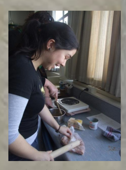
.....and a model of a sedimentary rock.

Ko koe kei tēnā kīwai, ko au kei tēnei kīwai o te kete You at that and I at this handle of our kete.