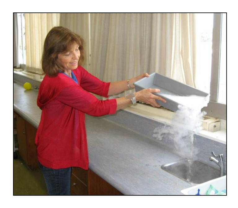
Using dry ice, at the start of a session on the particle nature of matter, as an intriguing 'hook' to engage the students and spark their interest.

In order to facilitate learner engagement, I use a wide range of learning and teaching methods in my classes. These include hands-on activities and investigations, small group work, group discussion, guest speakers, PowerPoints, role plays, ICT, co-operative exercises such as graffiti sheets and freeze-frames to cater for different learning styles. My lectures combine experiential and theoretical approaches and emphasise social interaction in small groups to fully engage the students in conceptual learning.