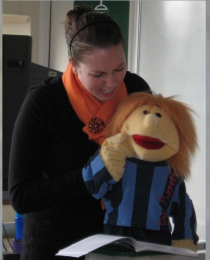
Parallel or series circuits in the house plan?