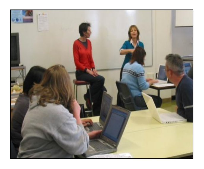
Summing up together at the end of a peer teaching session.

'Modelling' even exemplary teaching practice is not sufficient to help prospective teachers to think in more complex ways about teaching. Rather, they require access to the thoughts and actions that shape teaching and need to be able to see and hear the pedagogical reasoning that underpins the teaching students are experiencing. To achieve this objective a colleague and I team-teach a single class, with both of us present for each session.