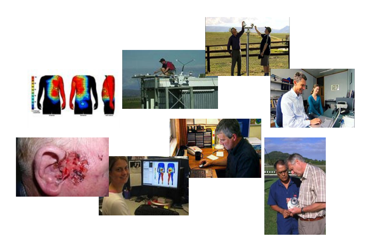
'You, Me and UV' images from the Hub.