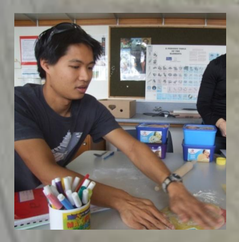
Continental drift in action.