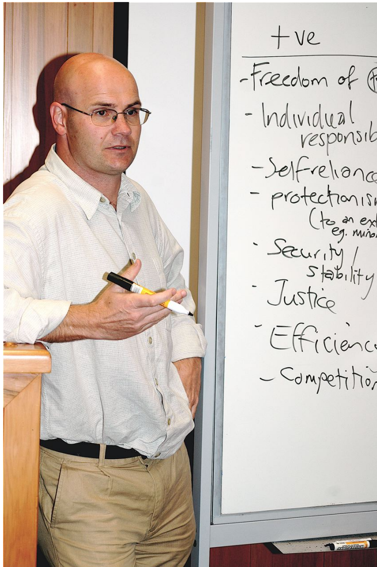
Figure One: Lecturing in Studies in Contract Honours course, March 2006.