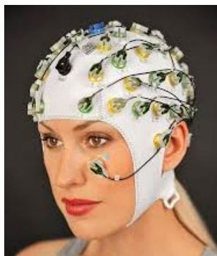
The Auckland University EEG cap

We will not be looking for seizures using EEG, instead we will be looking at how the visual processing part of your brain is functioning. This is because the visual processing part in your brain can tell us a lot about how your brain is responding to hormones more generally.