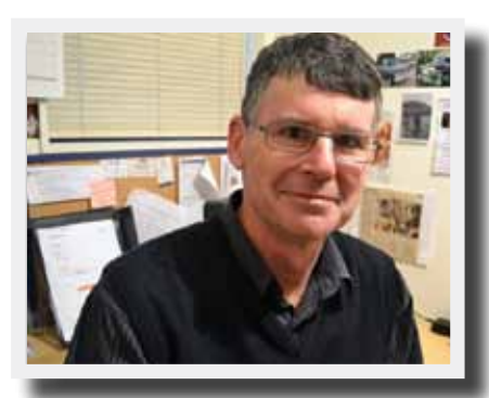
GP and palliative care teams p. 19 How do they best work together?