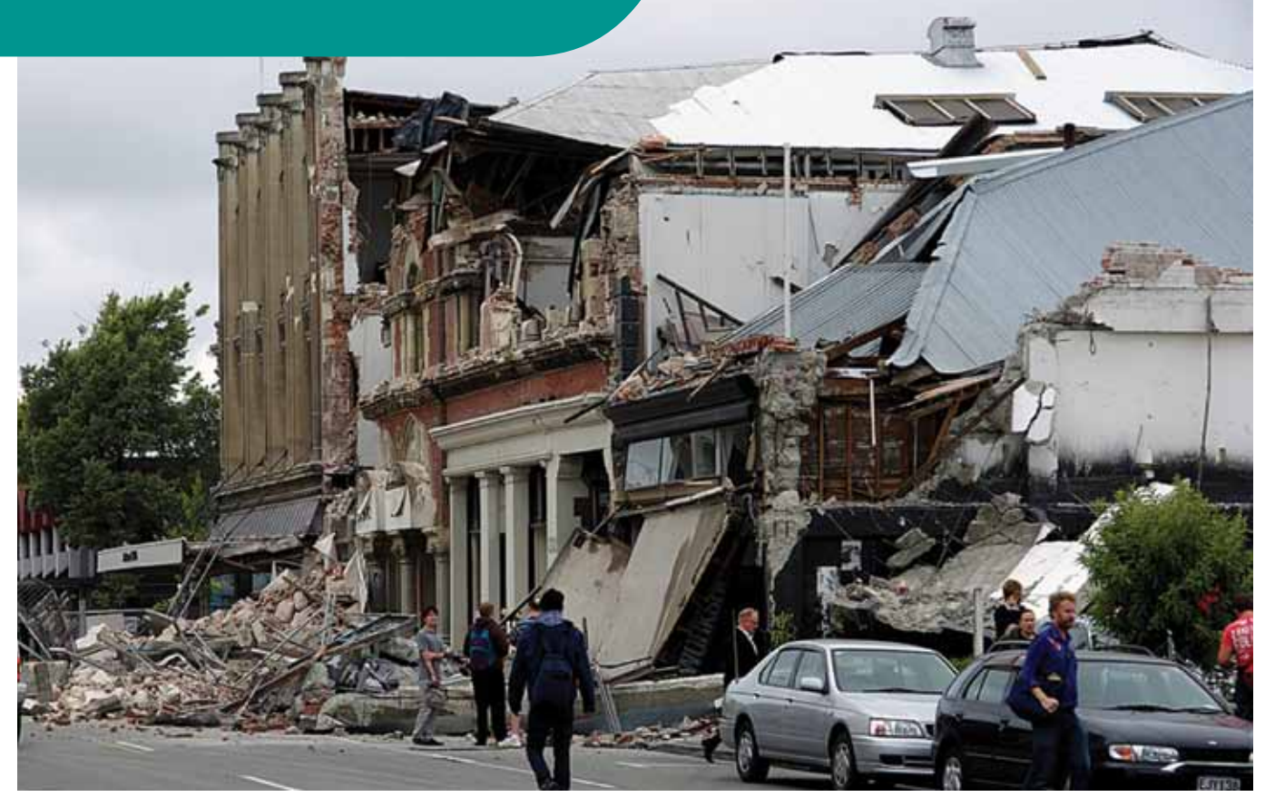
Christchurch street scene after the 2nd earthquake