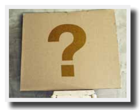
Grounded Theory p.10 Researchers give their views on GT.