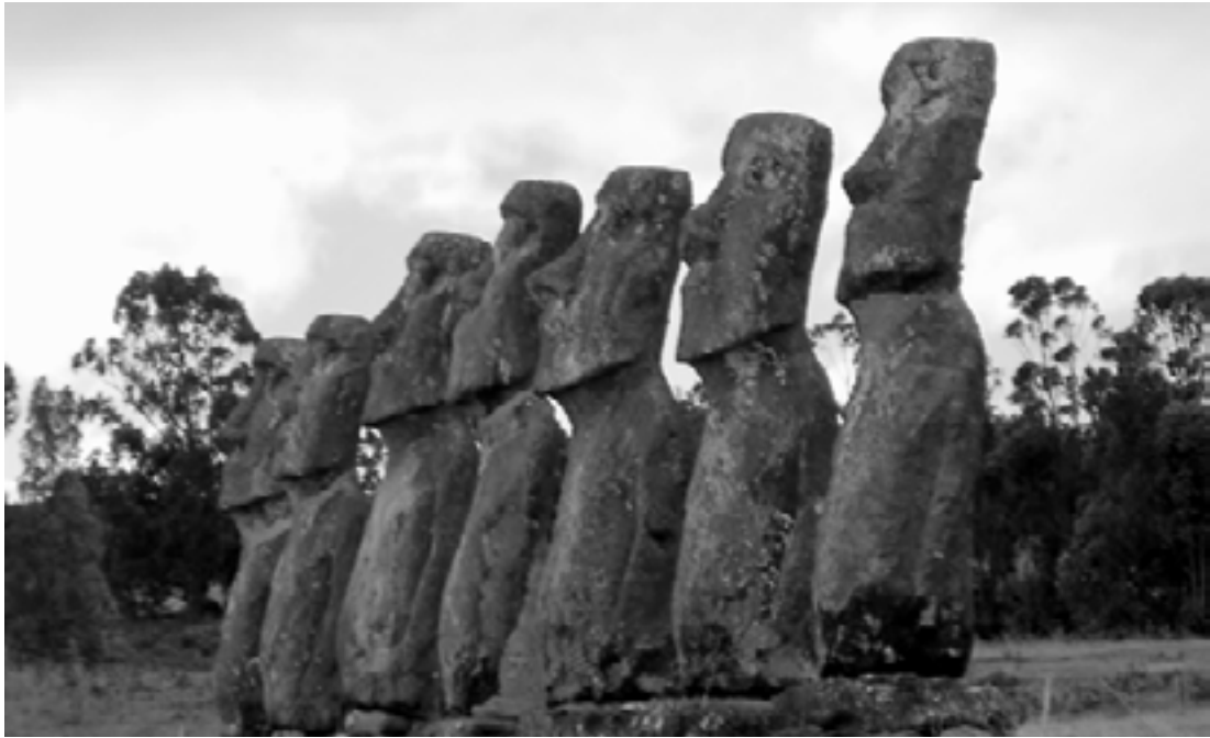
Moais in the Rapa Nui National Park, material and cultural heritage of the Rapa Nui people, administered by Corporación Nacional Forestal (CONAF).