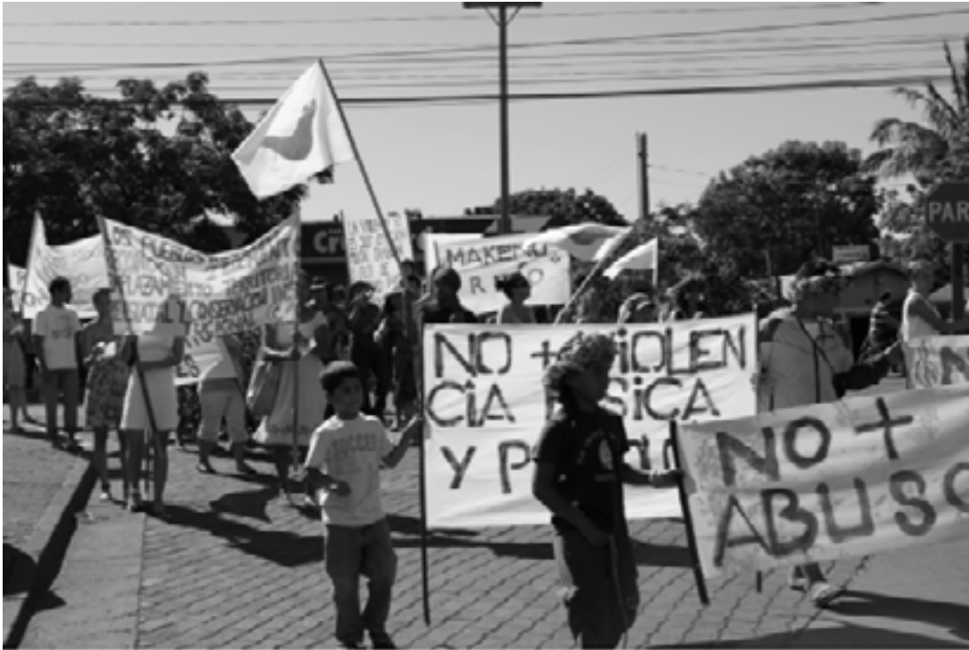
Demonstration in support of the Hitorangui clan and their land claims, February 26, 2011. Isabel Burr, Sacrofilms files.

members of special police forces were sent from Chile in October and another 90 were sent in December. The number of detectives on the Island was also increased. The Attorney General appointed a Deputy Prosecutor specifically for the criminal cases arising from the land claims.