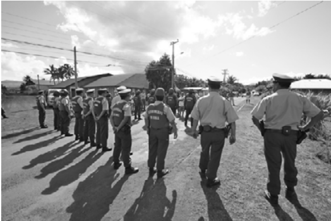
A Carabineros de Chile contingent prepared for the eviction of the Hitorangui clan from the Hanga Roa Hotel, on February 2 of 2011. The eviction was implemented without previous judicial order two days prior to the judicial hearing where the formalization of the clan members took place.