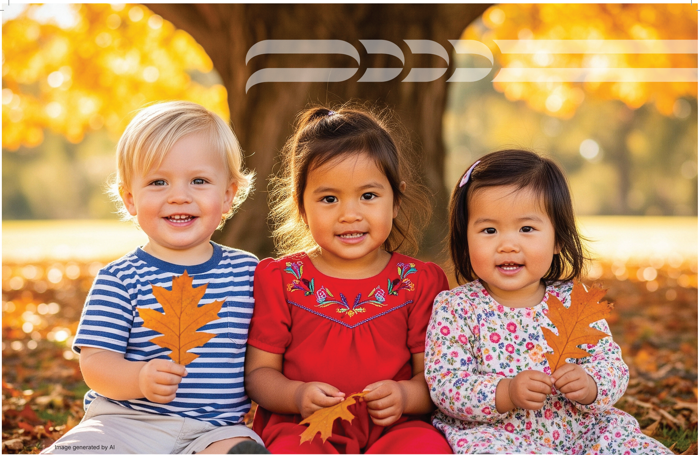
Image generated by AI