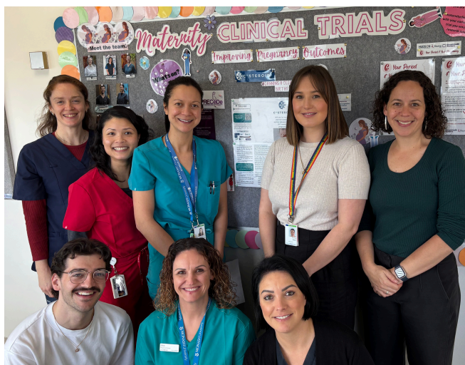
Back row (L to R):

Once again, congratulations for reaching this significant milestone. We appreciate your enthusiasm and continued efforts in support of this important research.