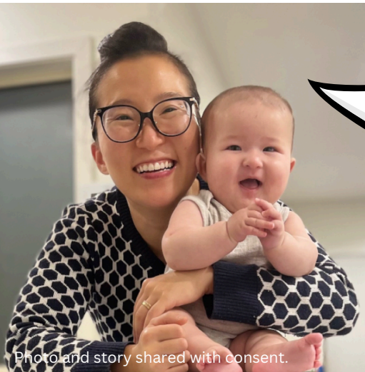
Photo and story shared with consent.

Head to our Facebook page to read more C*STEROID participant stories.