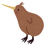
Team New Zealand

Our biggest event of the year is back! The Trans-Tasman C*STEROID recruitment challenge is happening next month in August.