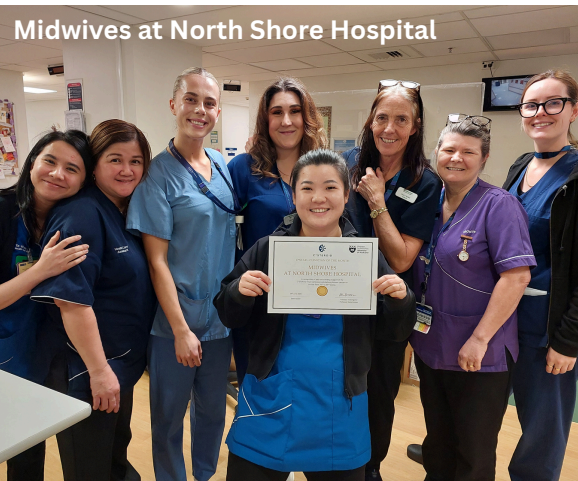
Midwives at North Shore Hospital

Here is what the team shared about their experience with the C*STEROID trial: