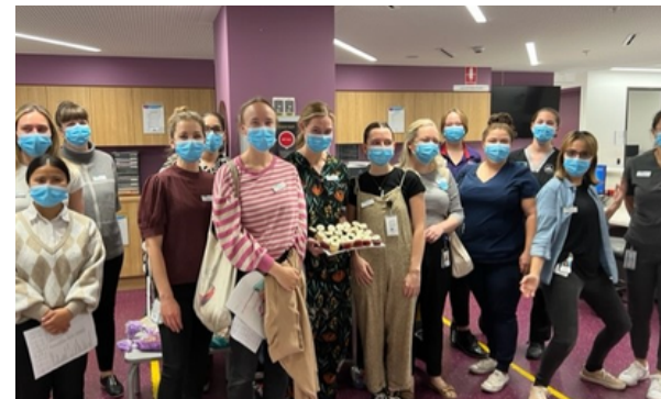
Sunshine Hospital - Yellow ANC MW team

The C*STEROID trial has been rolling out in Australia, and we would like to extend a warm welcome to all our new sites.