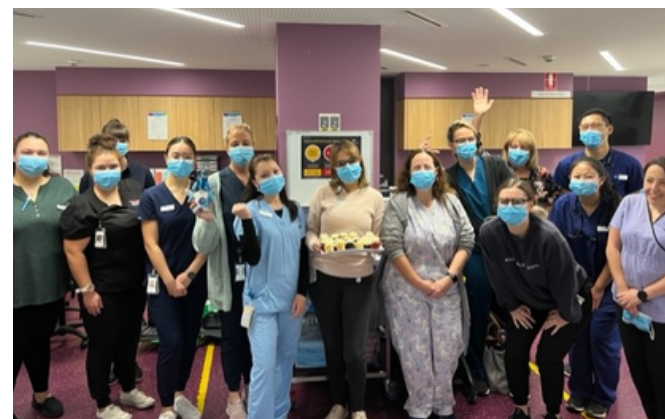
Sunshine Hospital - Blue ANC MW team