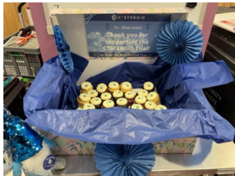
Cupcakes for Sunshine Hospital commencement events