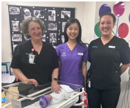
Team at Mercy Hospital for Women