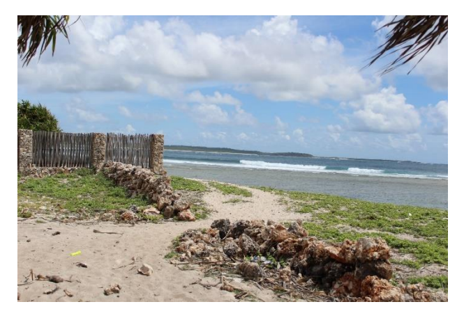
Photo 4.5. Fence constructed by a hotel to block public access to the beach in Bo'a village

Another region where women's livelihoods and access to resources have been negatively affected is on Rote Ndao, a regency in NTT province, situated south-west of the western tip of West Timor. Bo'a Beach at the western side of Rote Island has been the venue of an international surf competition for several years, which has recently attracted a number of investors from other parts of Indonesia to raise the touristic profile of the island. In 2013/2014 access to the famous surf beach was blocked by a hotel development project of a company owned by the grandson of a former Indonesian president, which led to the relocation of the surf competition to another beach, Nemberela (Photo 4.5).