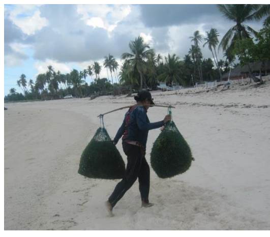
Photo 4.7. Woman carrying seaweed for drying on the beach in Nemberala village