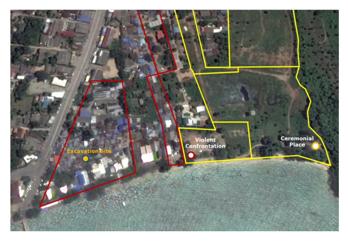
Figure 5.2. Map of the disputed sites in Baan Rawai

Note: The boundaries of the disputed land plots are approximate and not meant to be interpreted or used in any legal sense.