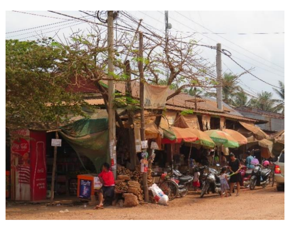
Photo 8.2. Shops and street vendors in a village inside the core zone of the AAP

The Angkor Archaeological Park (AAP) was listed as a "World Heritage in Danger" by UNESCO in 1992, a year after the 1991 Paris Peace Accord, which brought relative political stability to post-conflict Cambodia. The AAP was subsequently subjected to a zoning process, with Zone 1 defined as a core zone with the highest level of protection and Zone 2 described as a buffer to protect the core zone. Regulations regarding these two zones have strong implications for the more than 120,000 residents divided into over 100 villages and hamlets (Photo 8.2), most of which had occupied the land prior to the World Heritage designation (Gillespie, 2009).