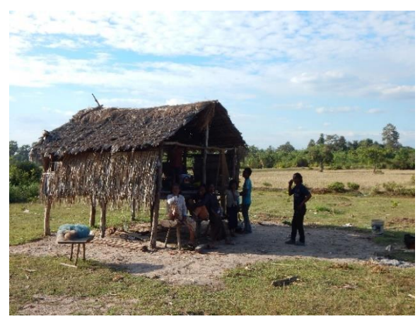
Photo 8.3. Community members guarding their rice fields against dispossession by APSARA