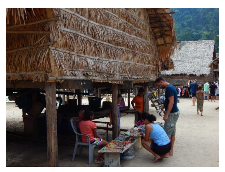
Photo 5.2 . Moken villagers on Koh Surin selling souvenirs to tourists