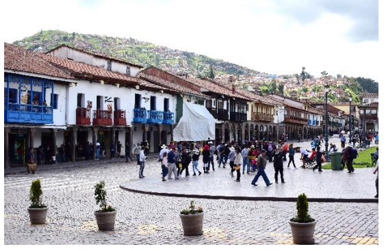
Photo 8.8 The gentrified centre of the City of Cuzco as a 'safe tourist space'