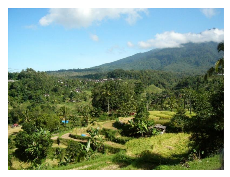
Photo 4.1. Bali's iconic rice terraces, protected under UNESCO's World Heritage programme