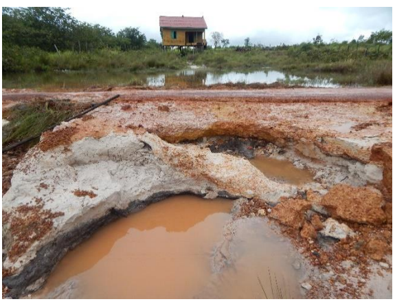
Photo 3.5. Road condition in the relocation site during the monsoon season