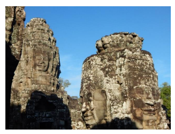
Photo 8.1. Historic monuments at the Bayon Temple in Angkor Archaeological Park (AAP)

The Angkor Archaeological Park is situated in Cambodia's Siem Reap Province on the northern shores of the Tonle Sap Lake, which is Southeast Asia's largest freshwater lake and has been described as the country's 'beating heart'. It is a place of exceptional archaeological significance, with magnificent monuments (Photo 8.1) such as Angkor Wat, Angkor Thom, Bayon and Ta Prohm, dating from the 9<sup>th</sup> to the 15<sup>th</sup> century when the Angkor region was the capital of an expansive Khmer empire (Gillespie, 2009).