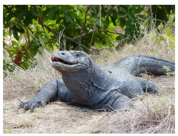
Photo 4.3. One of the iconic Komodo dragons in Komodo National Park

Labuan Bajo – situated on the western end of NTT's Flores Island – is undergoing a particularly rapid transformation from a once quiet port and fishing town to a bustling tourism destination. The main drawcard to this town is the nearby Komodo National Park, which is the habitat of the Komodo dragon, the world's largest lizard (Photo 4.3). The area also harbours some of the finest beaches and diving spots in Southeast Asia. The government has set a target of 500,000 visitors for the town by the year 2020, which is a fivefold increase compared to 2016 (Remmer, 2017).