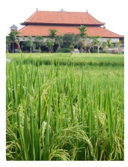
Photo 4.2. Large tourist resort next to rice fields in Ubud, Central Bali