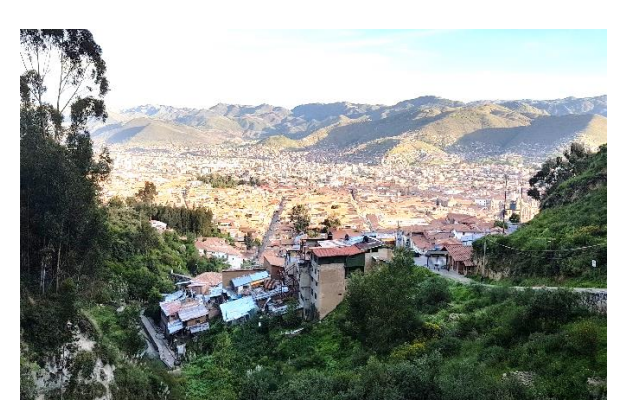
Photo 8.7 Panoramic view of the City of Cuzco in the Southern Andes region of Peru

The 'City of Cuzco' obtained World Heritage status in 1983, together with 'The Historic Sanctuary of Machu Picchu' which many tourists that visit Cuzco also have on their itinerary. The Ministry of Culture and the Provincial Municipality of Cuzco bear primary responsibility for the preservation of the city's cultural heritage programmes and the management of the World Heritage property and perform regular urban assessments, registration, protection, and control works. The Municipality has made extensive efforts towards creating a clean and safe environment for tourists (Steel, 2013). Cuzco's historic center has been transformed from a residential zone into a huge commercial center dedicated to international tourists who are able to pay the steep prices of the luxury hotels, restaurants and souvenir shops (Chion, 2009). While UNESCO regards new tourism development as a threat to the preservation and functional capacity of ancient buildings, Cuzco authorities clear the city of 'urban undesirables', such as beggars, street vendors and the urban poor, in order to provide tourists with a sense of comfort and security (Steel, 2013; Photo 8.8).