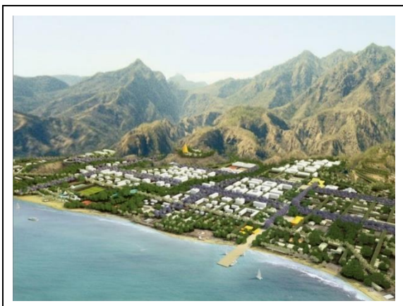
Shopping mail Residence Residence Figure 3.2 Korean engineers' vision for Pante