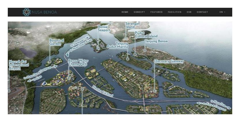
Figure 4.1. The dreamed-up vision of the Benoa Bay Reclamation Project with its many artificial islands

Sources: Cabasset et al., 2017; Ardhana & Farhaeni, 2017; Benge & Neef, 2018; Suriyani, 2018