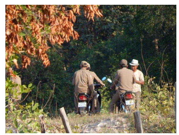
Photo 8.4. Police on patrol around the village facing dispossession of their rice fields