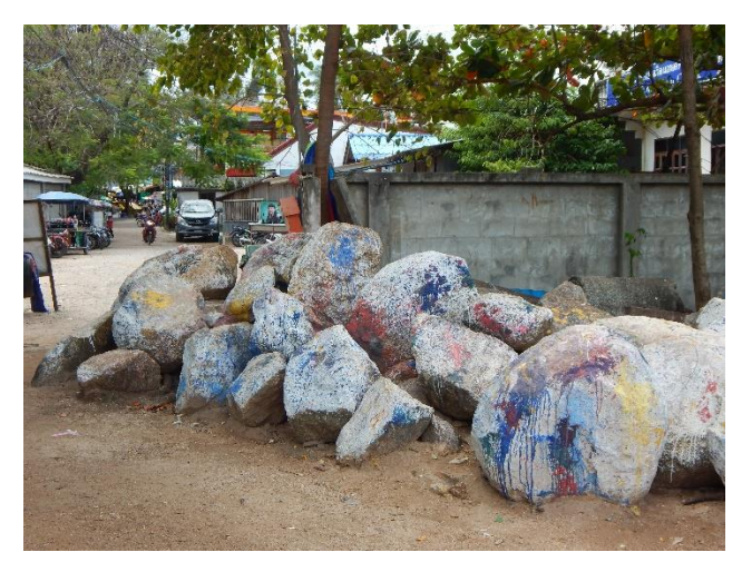
Photo 5.4 . Boulders placed by company workers to block villagers' access to their ceremonial area