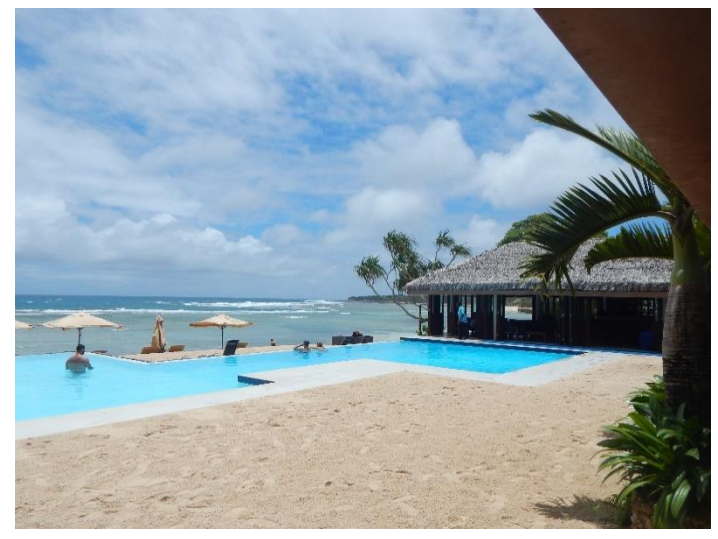
Photo 4.8. Beach resort in the Pango district of Vanuatu's capital Port Vila

The tourism sector in Vanuatu is characterised by a 'dualistic' structure, where about one third of the foreign visitors arrive by air and stay in hotels, resorts and guesthouses for an average of 8-9 days, while two thirds of visitors arrive by cruise ship and stay only for one day without the need for accommodation in the country. Cruise tourists are primarily targeted by local tour and cultural show operators, who are mostly indigenous ni-Vanuatu whose small businesses are protected by the so-called "Reserved Investments" clause under the Foreign Investment Promotion Act. On the major islands, the hotel industry – which is much more capital-intensive – is dominated by foreigners, who benefit from favourable investment conditions, such as tax exemptions and relatively low lease rates for beachfront properties (MTICNB, 2013). Most tourists stay on Efate Island where the capital Port Vila is located (Photos 4.8 and 4.9).