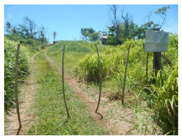
Photo 4.10. Fenced-off expat property development in Southern Efate

Enclosure of coastal areas by tourism enclaves particularly affects women's livelihoods, as they engage mostly in fishing from the shore and on the reefs, while off-shore fishing is dominated by men (Government of Vanuatu 2015). Some of the local men are still able to negotiate access to the beach as they often know the hotel guards who hail from their own community.