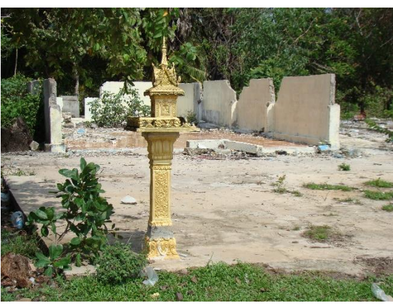
Photo 3.3. One of the houses that was knocked down by the company's security guards