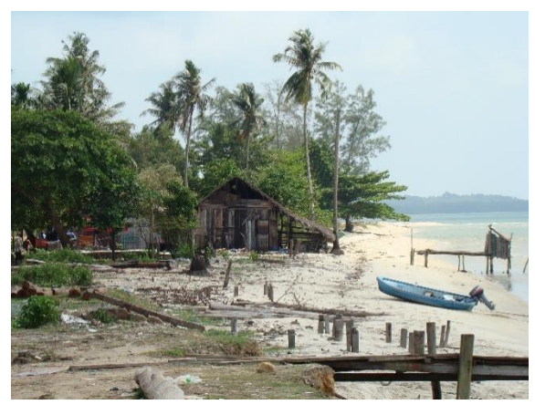
Photo 3.2. Abandoned coastal settlement after involuntary relocation

were settling on state public land and were therefore legally obliged to relocate (Drbohlav & Hejkrlik, 2018). On the occasion of this visit, villagers also received a promise for compensation land in the area where they were to be relocated. In addition to the 1,163 families, at least one primary school and three Buddhist pagodas needed to be relocated (Neef & Touch, 2015). Negotiations for compensation packages were conducted in 2010, and about 1,000 families were resettled in 2011 (Drbohlav & Hejkrlik, 2018). Many relocated families reported that they had not received the negotiated compensation but much smaller amounts. Some families resisted relocation and had their houses knocked down by the company's security guards (Photos 3.2 and 3.3).