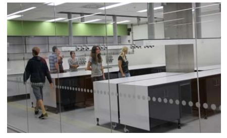
The new Chemistry labs are housed in the 303 building.

To learn more about the renovated labs, visit www.science.auckland.ac.nz/chemistrylabs