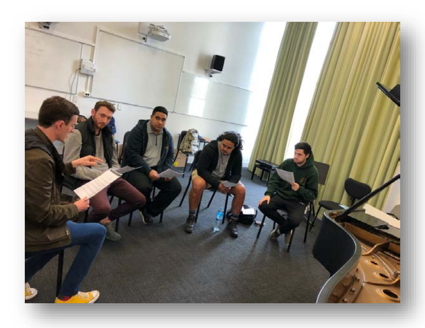
Prior Learning Project-Solfege class

This led to workshops funded by the University's Centre of Learning and Research in Higher Education. The project confirmed the notion that when developing strategies for improving the achievement of Pacific students, the students are the experts in the room.