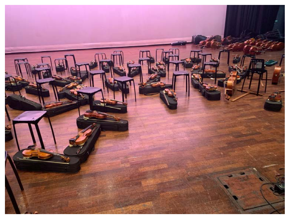
Sistema Aotearoa, Hui Taurima Manukau, 2021

A performance artist presents a work in an art gallery at an international symposium. He invites indigenous participants to contribute. We enter the gallery, walking down a red carpet, and react to the paintings on the wall. Unlike dignitaries sipping champagne and admiring the art objects, we cry, we grieve, we scream, we look with horror at the public representations of colonial history. We fill the space with a soundscape rarely heard in a temple of western art. We create a different type of community music. (Rakena, 2019)