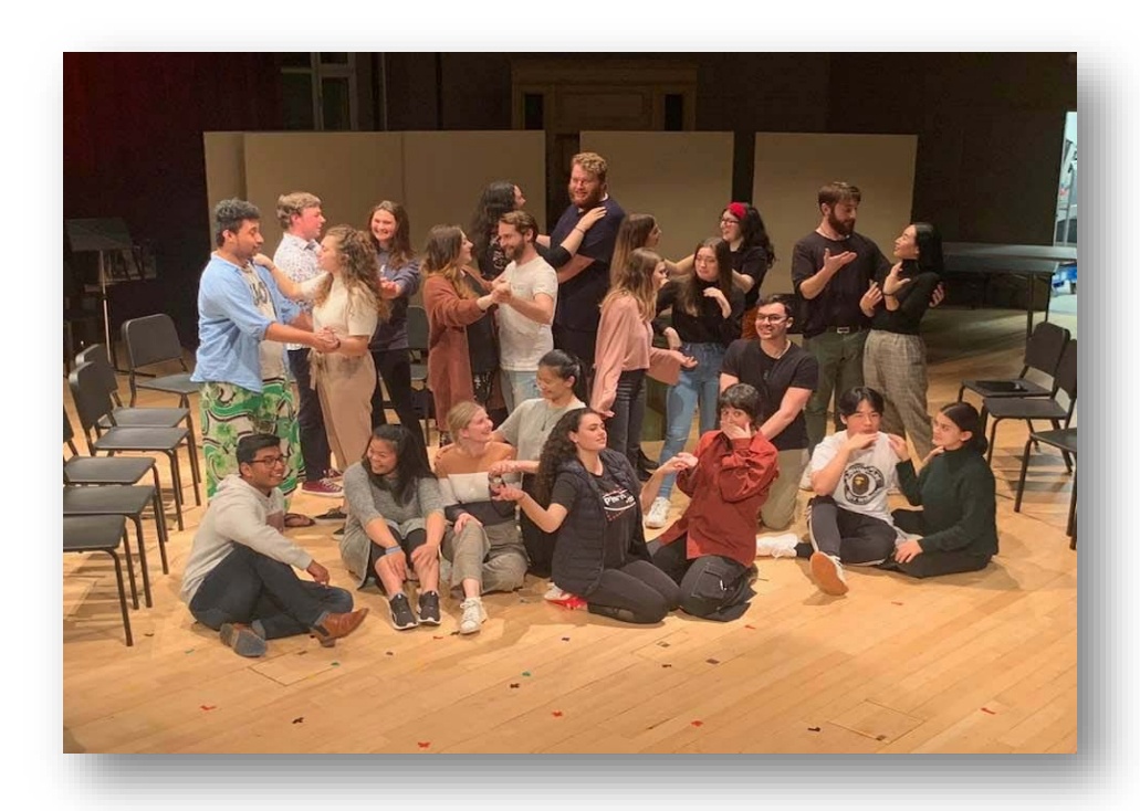
Voice class opera scenes rehearsal