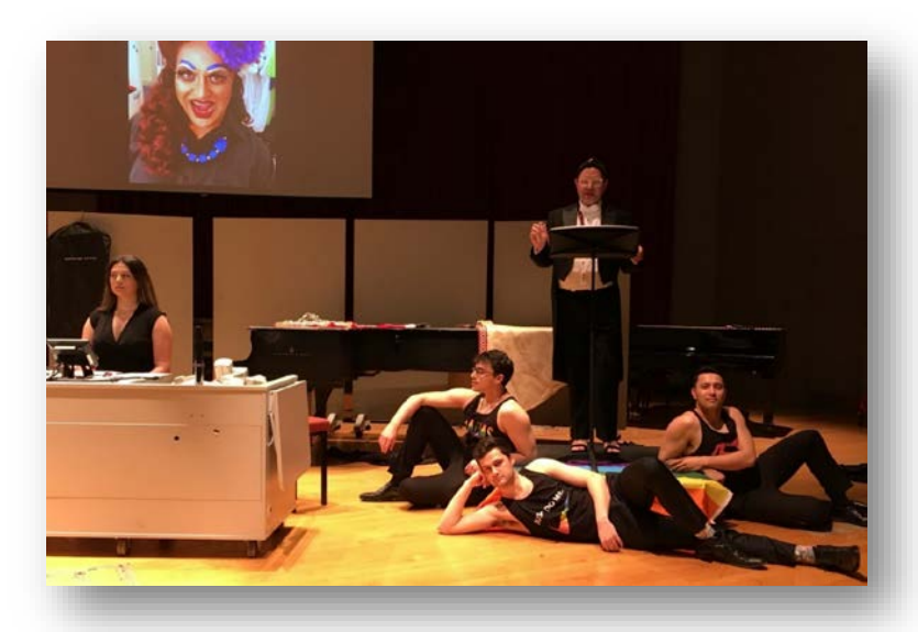
Historical Trauma Performance with voice students

Performing is an important component of my teaching and leadership profile. As my students began to participate in high-profile competitions, I realised my praxis had become too theoretically focused and removed from the realities of performance. I returned to the stage to enhance my studio teaching, to remind myself what singers, foreground in the performance moment. Modelling professional level skills has increased the credibility of information delivered in studio. I believe these are contributing factors to my students' ongoing success nationally and internationally.