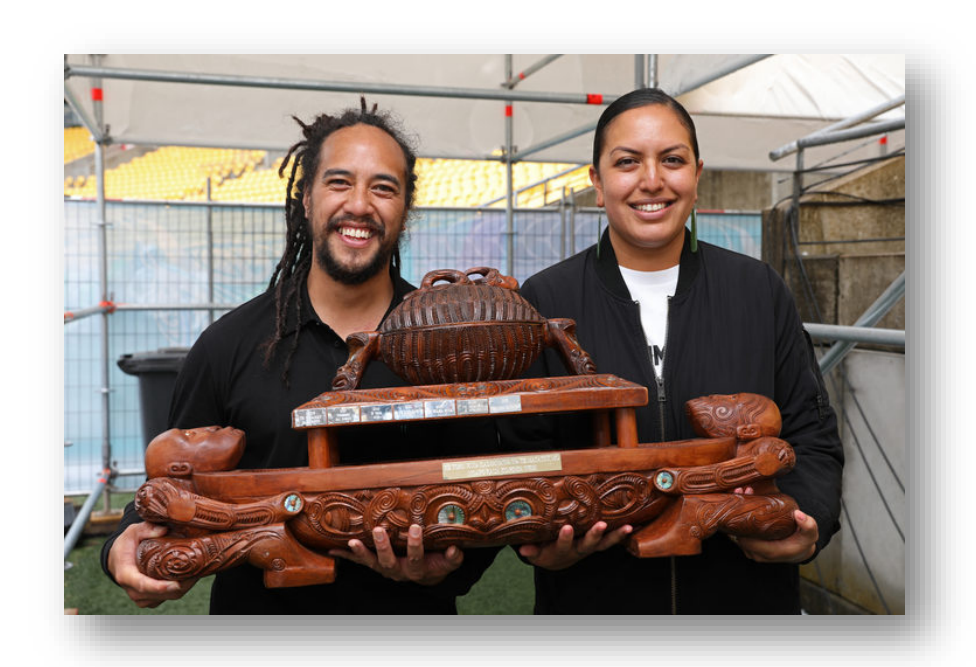
Ngā Tūmanako leaders with winning taonga at Te Matatini, 2019