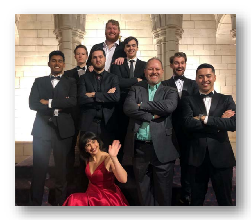
Senior voice studio students, 2019

The following sections of my portfolio describe how this process, something I call studio-ing, developed as a concept and underpins my teaching innovations.