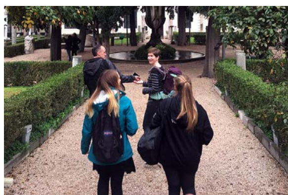
Teaching on-site in Rome (Left: at the Colosseum; Right: at the Baths of Diocletian)

I adopt specific teaching practices to create a welcoming tauhi vā, a space among the participants. I tailor these to the particular course. For example, the Study Abroad course in Rome requires almost a month of intensive teaching and round-the-clock pastoral care. High-level engagement with each student underpins a positive and caring group dynamic. In our travelling virtual classroom, I extend manaakitanga to each student, identifying their exact interest in the day's itinerary and connecting their interests to other students' questions. I use the Socratic method to ask probing questions about the ethics of excavation, conservation