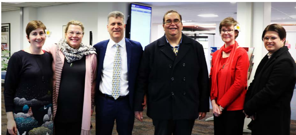
Members of the 2019 Ako Arts team with the Dean of Arts at the Staff Excellence Awards

In 2016 my achievements in teaching were recognised through a Faculty of Arts Teaching Excellence Award. I am also honoured to be part of the 2019 Ako Arts team that won a Faculty of Arts Staff Excellence Award for Rangatiratanga for our work to embed Māori and Pacific worldviews in the classroom.