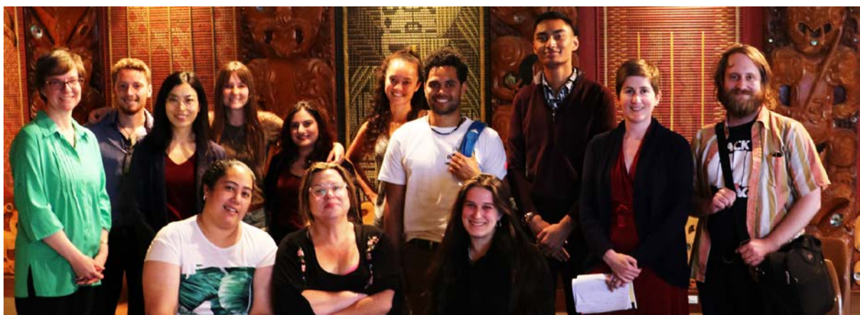
Staff and students on the Ako Arts programme at Waipapa Marae