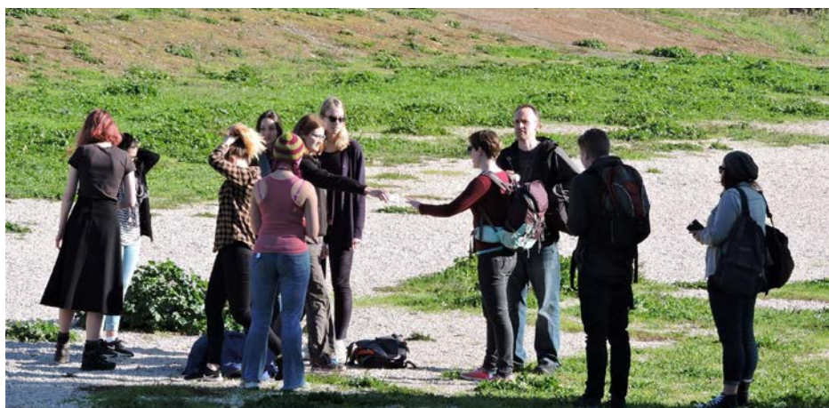
Teaching on-site in Rome at the Circus Maximus

Learning languages is a vital part of my professional development. Language helps me understand people and their culture. In 2014 I started learning Italian, to better facilitate our Study Abroad course. This has been rewarded each time we teach in Italy. Speaking Italian has opened up normally closed archaeological sites and smoothed our travels. It also inspires students to pick up some Italian themselves, showing respect for the country we are studying.