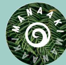
Manaaki UoA @manaaki_uoa