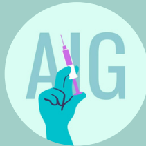
Anaesthesiology Interest Group @aig.uoa

Search groups up on Instagram or Facebook to learn more, and keep an eye on the cohort Facebook page for notices about their events!