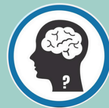
Student Psychiatry Interest Network @spin_uoa