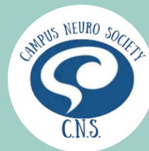
Campus Neuro Society @campusneuroso ciety