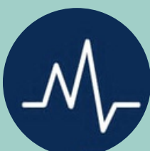
The Free Mock MMI @the_free_mock_m mi