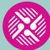
Students of Rural Health Aotearoa @sorha.nz