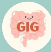
Gastroenterology Interest Group @gig.uoa