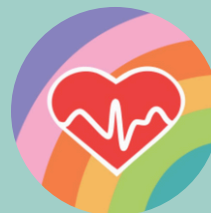
Rainbow FMHS @rainbowfmhs