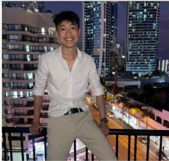
Sports Ben Cen