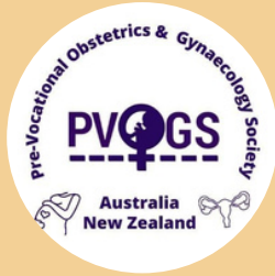
Pre-Vocational Obstetrics & Gynaecology Society