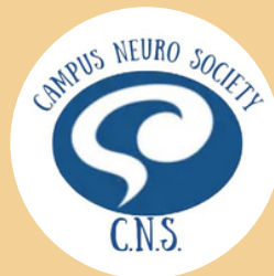
Campus Neuro Society