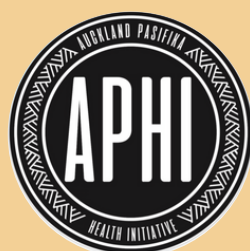
Auckland Pasifika Health Initiative