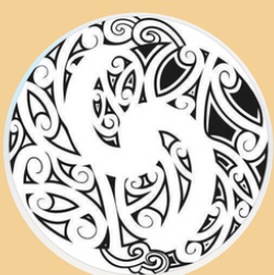
Te Oranga Māori Medical Students' Association