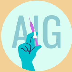
Anaesthesiology Interest Group

Search groups up on Instagram or Facebook to learn more, and keep an eye on the cohort Facebook page for notices about their events!