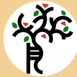
NZ Orthopaedic Education Group