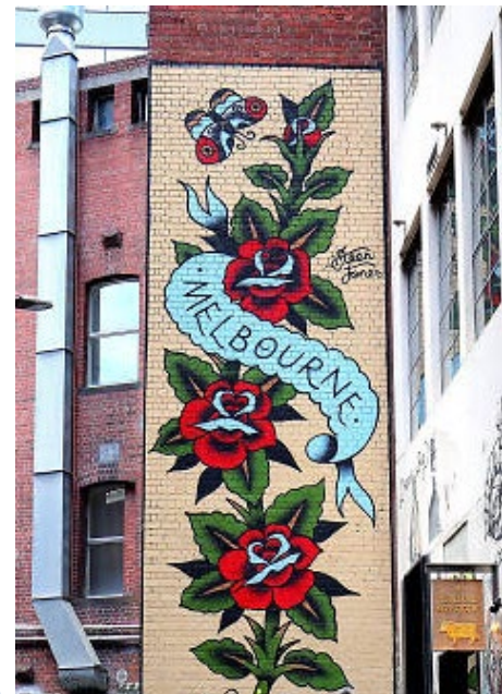
Duckboard Place , Melbourne, Victoria, 3000

Did you know Melbourne is famous for its street art? The University of Melbourne even has a subject called Street Art which allows students to explore and learn about the street art in Melbourne's laneways.