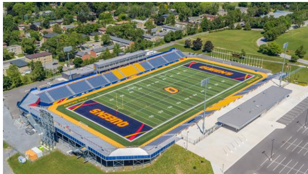
1 - Richardson Stadium

Queen's University is situated on traditional Anishinaabe and Haudenosaunee Territory.